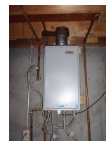
Tankless Water Heater