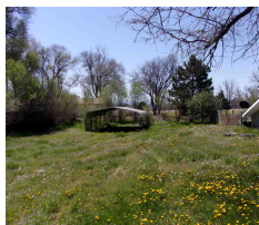
2 Car Carport